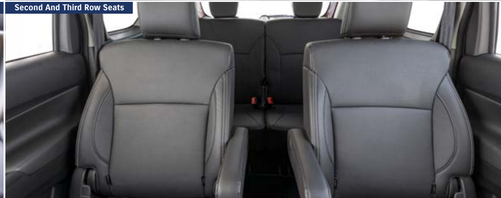
Second And Third Row Seats