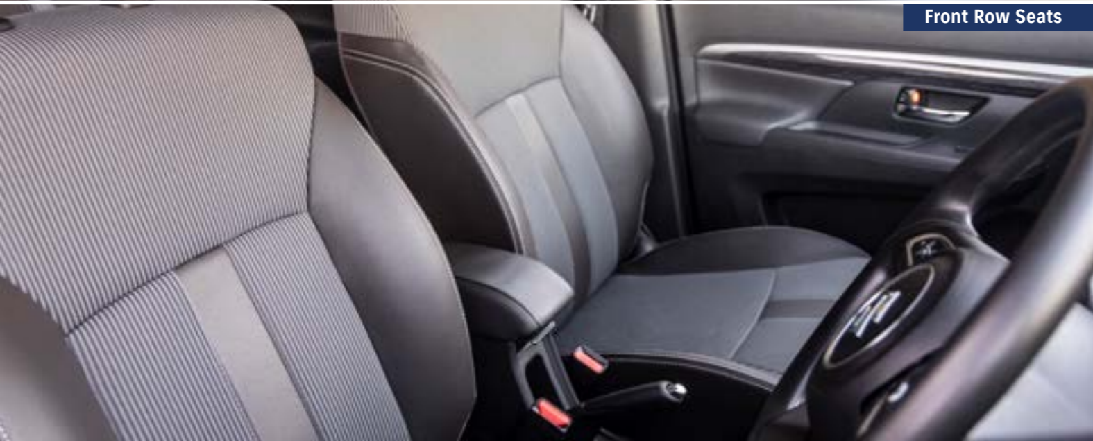
Front Row Seats