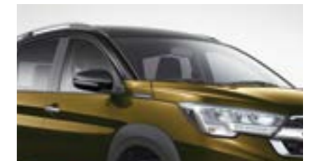
Brave Khaki Pearl x Midnight Black Pearl