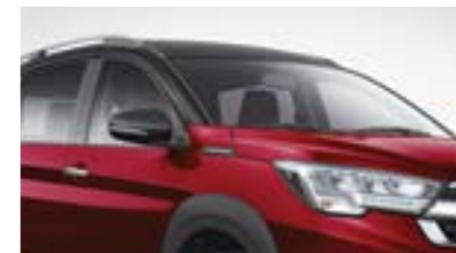
Opulent Red Pearl Metallic x Midnight Black Pearl