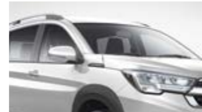
Arctic White Pearl