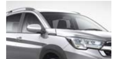
Splendid Silver Pearl Metallic