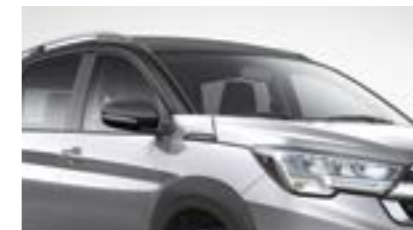
Splendid Silver Pearl Metallic x Midnight Black Pearl