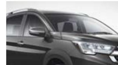
Grandeur Grey Pearl Metallic