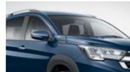
Celestial Blue Pearl Metallic