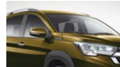
Brave Khaki Pearl - GL only