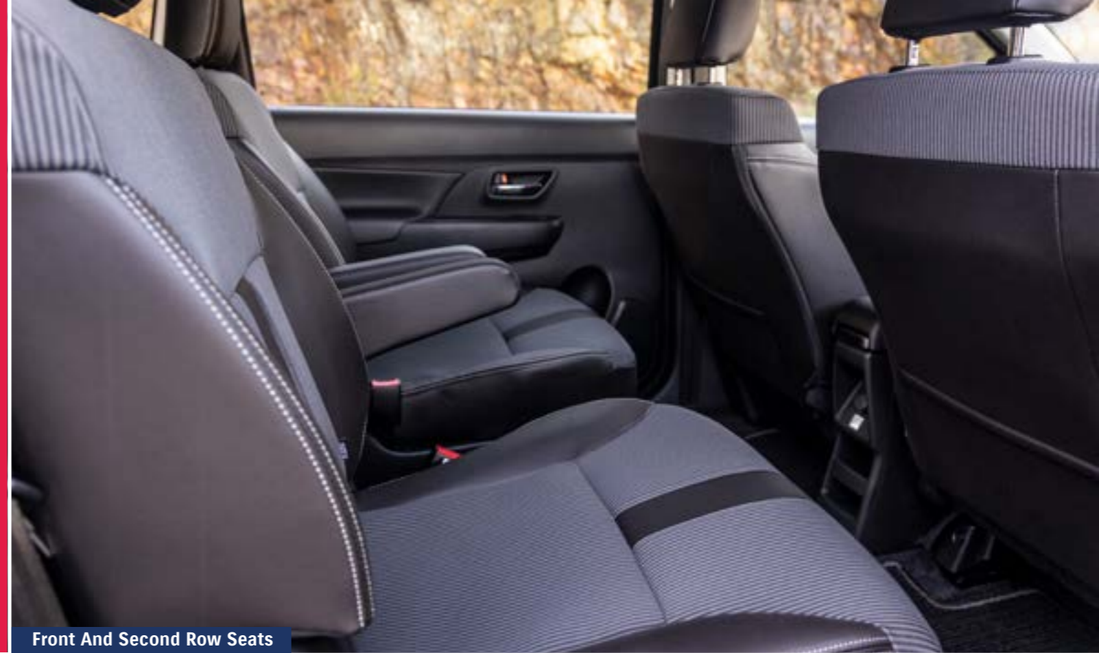
Front And Second Row Seats

Enjoy a realm of comfort with the XL6 and its spacious six-seater configuration. It offers auto climate control and a rear air conditioner, ensuring everyone stays comfortable throughout the ride. The inclusion of cruise control grants you the freedom to conquer the road effortlessly, improving your driving convenience. The XL6's second-row seats boast individual armrests, giving each passenger a first-class journey, while the versatile third-row seats provide ample space for friends and family. Thoughtful features like front ventilated cup holders and 12V accessory sockets in all three rows ensure that the XL6 is meticulously designed to prioritise your comfort.