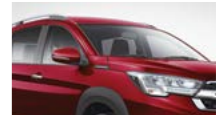
Opulent Red Pearl Metallic - GL only